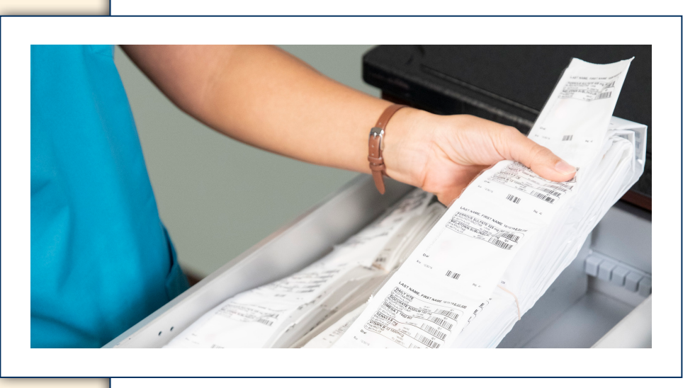
Messy med cart, because multiple pharmacies are being used.

Partner pharmacies safeguard our residents and help prevent medication errors. We chose to partner with Mullaney's, a Guardian Pharmacy, to provide our community with the best possible safety, care, and value. You will receive that same peace of mind and many other benefits from Mullaney's.